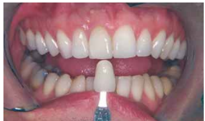
Figure 4. Postoperative appearance 2 years following the restoration demonstrates the maintenance of a good esthetic result on both devital and vital teeth. Enamel cracks did not show any further development.