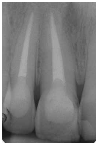
Figure 3. Radiograph of the upper right central and lateral incisors following the restorative procedure.