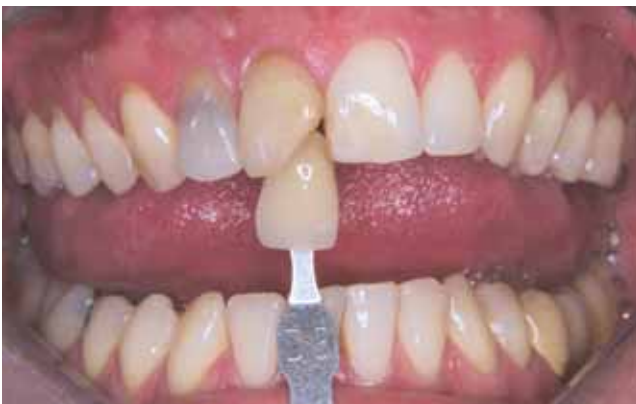
Figure 1. Preoperative retracted view of discolored, devital upper right central and lateral incisors in need of restoration. The upper vital left central incisor presented an existing resin composite restoration. The upper right central was fractured, devitalized, and restored with resin composite 8 years earlier; restoration debonding and discoloration is evident, as are horizontal and vertical enamel cracks.

p < .0001 ). Although the mean shade change between 2 weeks and 2 years was just 1.2, the difference was statistically significant ( p = .008 ). However, there was no significant difference between baseline and 2 weeks ( 12.9 \pm 2 ) versus baseline and 2 years ( 11.9 \pm 2.3 , t_{df=48} = 1.96 , p > .05 ).