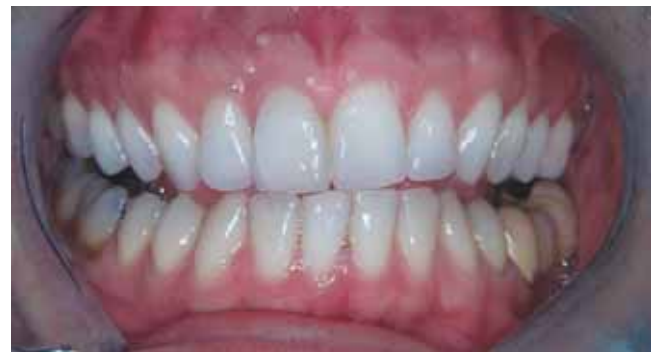
Figure 2. A significant change in shade was observed on both upper right central and lateral incisors once tooth whitening and the direct resin composite restorations were completed. The anatomy and shape of the upper vital left central incisor was also corrected (final result at the 2-week recall). Enamel cracks became more evident once the discoloration was removed on both the cervical third and distal incisal line angle of upper right central incisor. The cracks were related to trauma that occurred 8 years earlier.